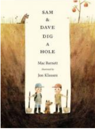
Sam & Dave Dig a Hole by Mac Barnett