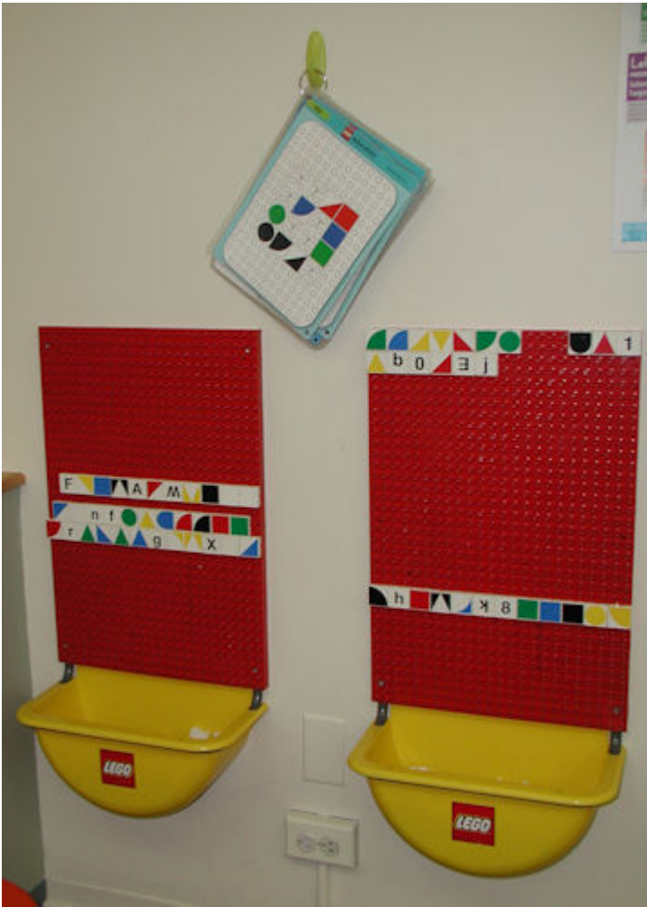
Duplo Boards foster letter knowledge and word recognition.