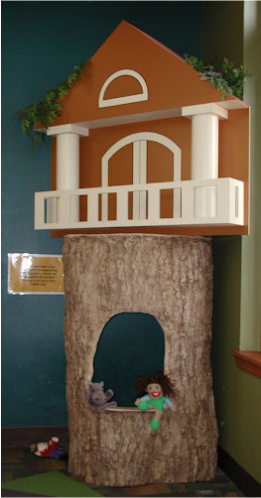
Puppet Tree House stimulates your child's imagination, fosters narrative skills and encourages cooperative play.