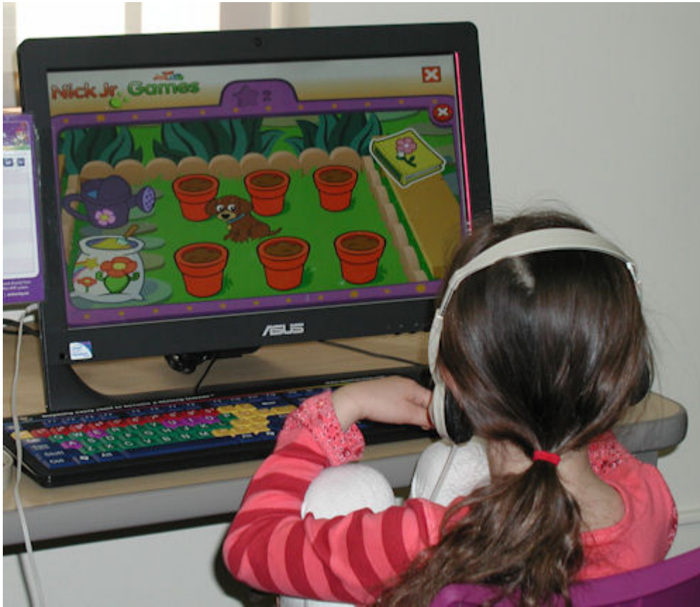
Reading Readiness Computer Stations (3 English language and one Bilingual/Spanish) feature more than 60 educational software programs spanning seven curricular areas.