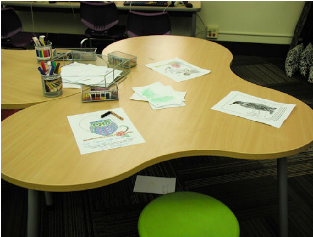
Art Table Projects nurture your child's fine motor skills, creativity, and enjoyment of books.