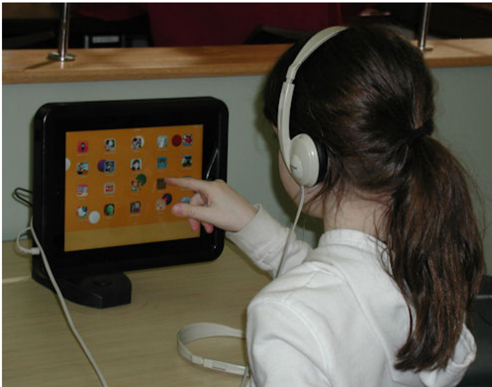
iPads feature a variety of early learning apps.