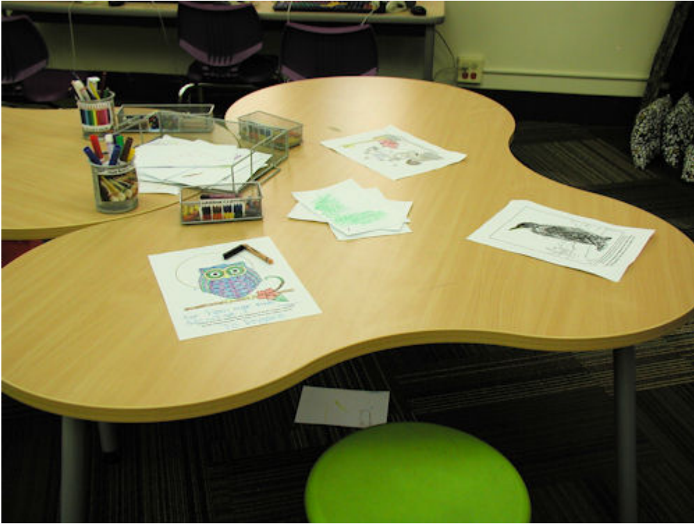
Art Table Projects nurture your child's fine motor skills, creativity, and enjoyment of books.